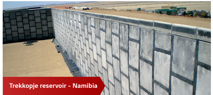
Trekkopje reservoir - Namibia