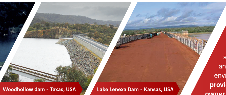
Woodhollow dam - Texas, USA

The Reinforced Earth® method is well known to combine strong technical and operational benefits with aesthetical properties while providing substantial cost savings. When architectural considerations are an issue for the construction of dams in sensitive environments, the Reinforced Earth® solution can provide the right answer to the requirements of the owner and local community.