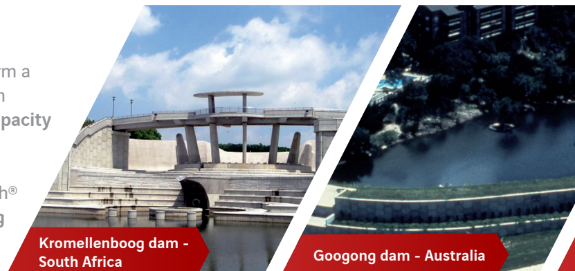
Kromellenboog dam - South Africa

The Reinforced Earth® technique can also be used to form a double-faced structure allowing to raise the height of an existing earth dam and thus to increase the spillway capacity and eventually the holding capacity of the reservoir it impounds. In addition to its cost efficiency, the uniform distribution of the loads throughout the Reinforced Earth® mass and the ability to increase the stability of existing embankments make the method well suited for construction on top of earthfill dams.