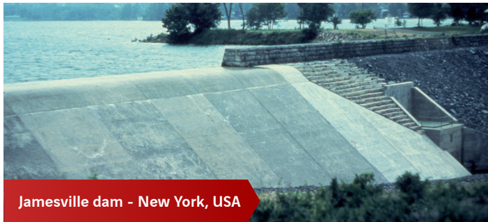
Jamesville dam - New York, USA

Strengthening century old dams built for example of stone and cyclopic concrete masonry concrete or under designed dams can be achieved by improving their stability by means of Reinforced Earth® works. High-water spillways of Reinforced Earth® walls with sloped facings abutting the downstream face of the existing structures allow to provide the adequate overflow capacity.