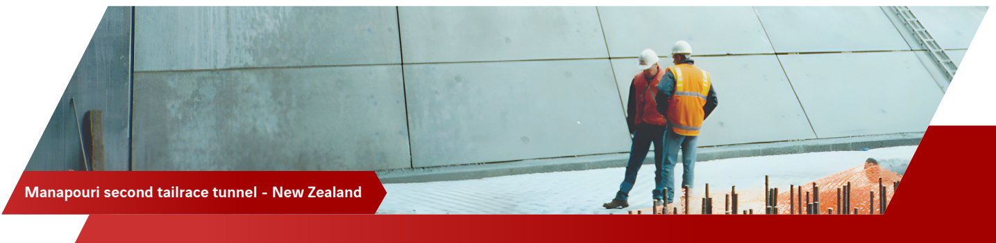
Manapouri second tailrace tunnel - New Zealand

Key intrinsic characteristics of the Reinforced Earth® technique such as ease and predictability of construction, strength, draining capacity of the facing allowing to accept rapid drawdown and, proven resilience to seismic events in earthquake prone areas are incentives to use this construction method for complex projects such as approach walls for intake structures or outlet works.