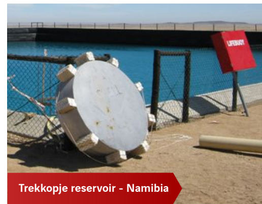
Trekkopje reservoir - Namibia

Demonstrating its versatility, the Reinforced Earth® technique has been used for the construction of reservoirs for potable water. Concrete segmental panels were combined with a UV resistant lining to provide water tightness. The GeoMega® system associating fully synthetic connections and reinforcements is well adapted to such structures, especially when chemically aggressive materials are sourced for the backfill. Enhanced durable water tightness can be obtained by fitting a waterproofing membrane on the GeoMega® sleeves at the back of the concrete facing.