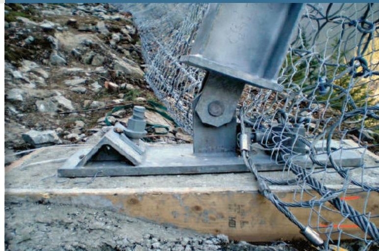
Anchorage for base plates consist of one tension anchor and one compression anchor for ease of installation. Concrete foundations are not necessary though there is full support of the base plate. As such, sometimes small pads are used when in soils.