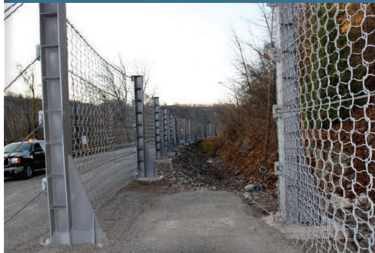
The lack of retaining ropes makes access and general maintenance of fixed rotation systems much more simpler than traditional hinged post systems.