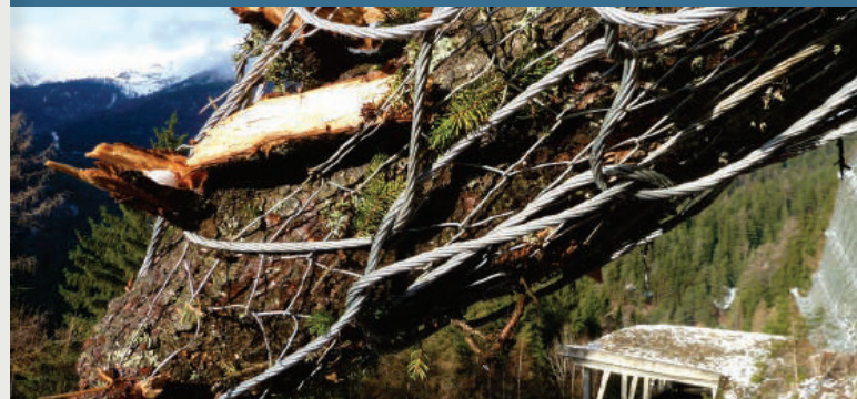
An example of a tree stem impact on a rockfall catchment fence.