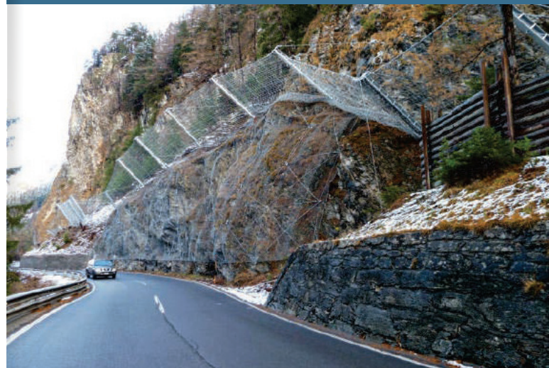
Due to their light weight and minimal foundation requirements, hinged systems are suitable for installation in even the most difficult terrain, including on vertical walls.