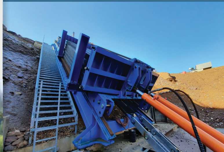
This inclined test facility is one of the largest and most modern in the world. It can accommodate a large variety of types of fences as well as earth dams.