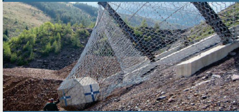
A completed Maximum Energy Level test for a 5000 kJ rockfall catchment fence.

Simply passing the certification process - where many components may be severely damaged - is not enough for us. Designing a system to pass an idealized event is not the same as designing a system to perform well under natural conditions. Hence, we expect more out of our systems and go above and beyond certification requirements to ensure that every primary component of the system is in a safe state following a Maximum Energy Level test, thus the motto: SAFETY WITHOUT COMPROMISE.