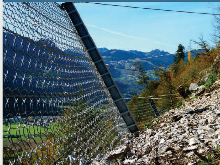
Catchment fences with a hinged connection between the post and base plate require upslope anchors and retaining ropes. As such, large energies can be accommodated while minimizing forces on the foundation of the post.

Two types of systems are available based on their certification: EAD 340059-00-0106 (former ETAG 027) or those tested in accordance with the WLV guidelines. Both are 1:1 scale tested but differ in their requirements for approval and construction.