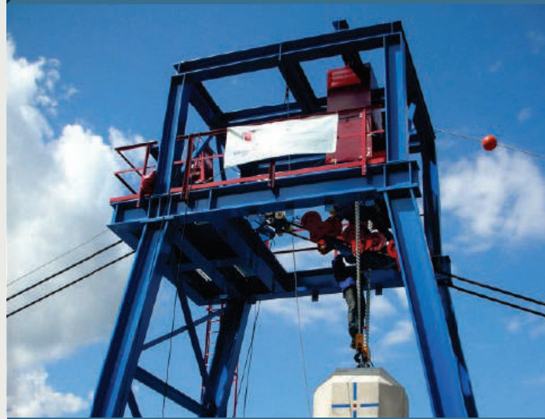
Tests following certification guidelines are carried out using standardized blocks to simulate impacts up to more than 5000 kJ.

We take great pride in providing the best client support at all stages of the project, whether in the initial planning phases or on-site technical support. With our highly capable team of engineers, geologists, and technicians, you can be assured that full support will be available and the project has been designed for SAFETY BY COMPETENCE.