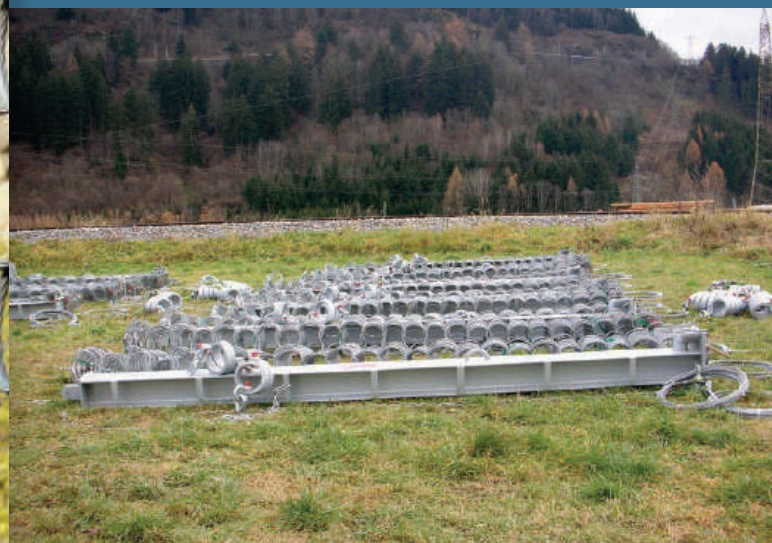
The key component to all systems is the highly flexible Omega-Net, that can easily be prepared with posts and ropes in compact packages for delivery by helicopter or crane. No shackles are required for attaching the net to bearing ropes.