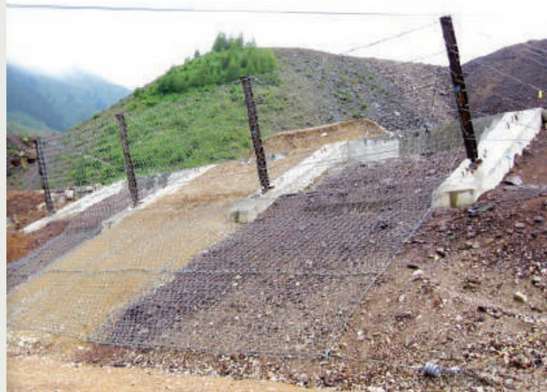
Before photo of a 3000 kJ hybrid test. The system consists of 5 m high posts with 12 m of Omega-Net.