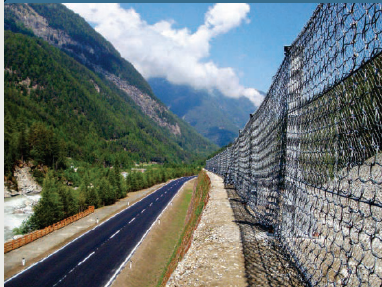
Fixed rotation systems are ideal for installing on walls or berms as well as in places where upslope anchors are either too difficult to install or where retaining ropes interfere with access requirements.