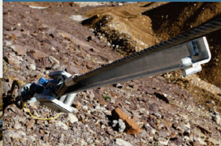
A new generation of brake elements uses a roller to deform an angled steel strip in a very efficient and compact manner.