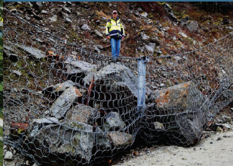
Two examples of hinged rockfall catchment fences impacted at and surrounding a post. These posts are robust and can withstand direct impacts without compromising the systems integrity.