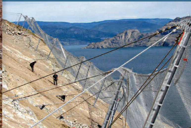
A lower energy attenuator system composed of High Performance Netting in combination with standard hinged posts and base plates.