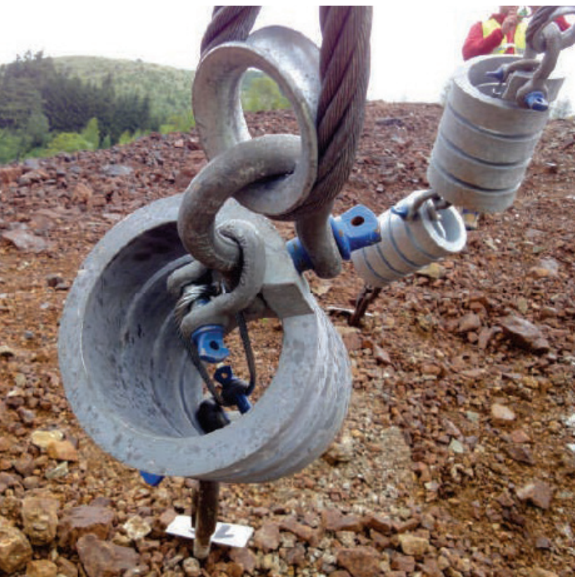
Several adaptations are made to a standard catchment fence to reduce maintenance such as the brake locks pictured above.