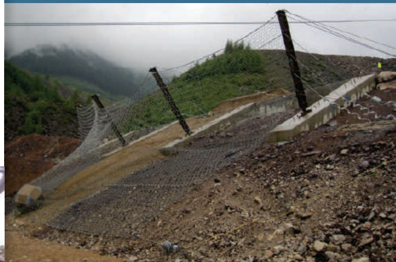
During the impact, the majority of the energy is absorbed during the initial contact with the upper section of the structure, but the projectile is allowed to progress through the system to the bottom portion of the net.