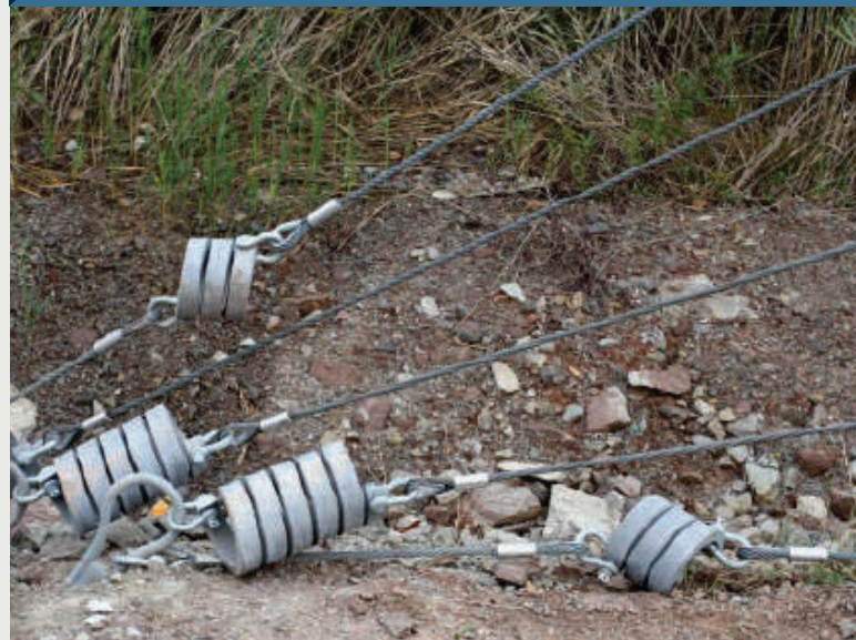
Brake elements are only found at the extremities of a system, directly at anchor points. All brake elements are connected with shackles to the ropes and can be easily changed. In this example, brake elements consist of large steel coils that unwind during impact.

The design procedure is an ever-evolving process. It is not just limited to the design team, but also includes constant feedback from our clients, and also contractors who install the systems and evaluate the performance of the systems in the field. It is only through such an interactive process that a high value product can be created.