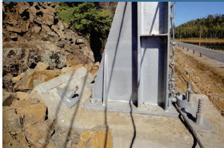
Because of the large forces acting on posts and bases, steel profiles are much larger than their hinged post equivalents, as are the foundation requirements.