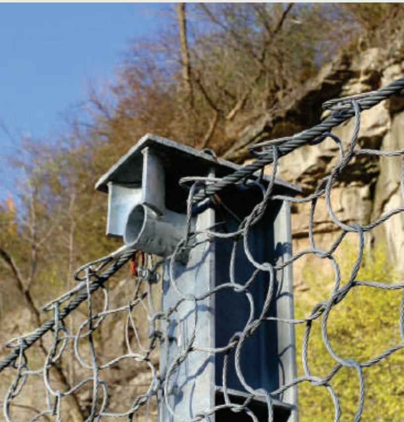
The rope guidances on the posts and base plates are integrated and designed to be robust, giving the ropes smooth surfaces to glide over during an impact to help minimize fatigue. There is no assembling required.