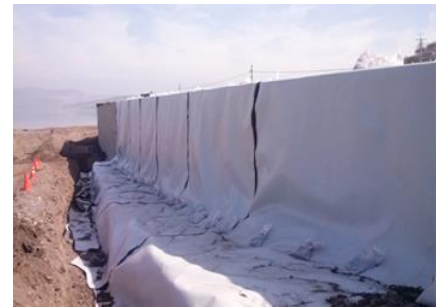
Left: Tierra Armada engineers designed the Reinforced Earth® wall to be raised to almost 22m high in Stage 2.