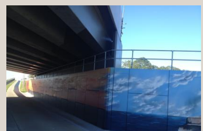
Right: Mango Hill Bridge abutment