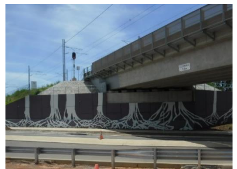
Main picture: Brays Road during construction Above first picture: Goodfellows Road Above second picture: Mango Hill Above third picture: Duffield Road