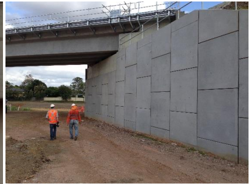
Left: Duffield Road during construction Above: Dohles Rocks Road during construction