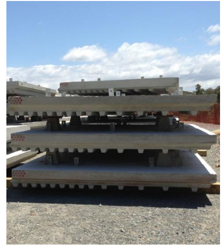
Left: A close up shot of RECO'S GeoMega® insert being cast into a panel. Once erected, the insert is threaded with a geosynthetic soil reinforcement strip.