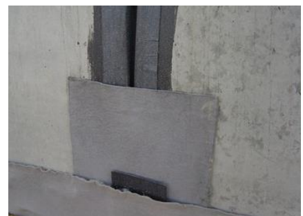
Main Picture: Construction of TechSpan® conveyor tunnel Top: Waterproofing TechSpan® Arch Middle: TechSpan® Arch unit interlock Above: 40mm movement joint