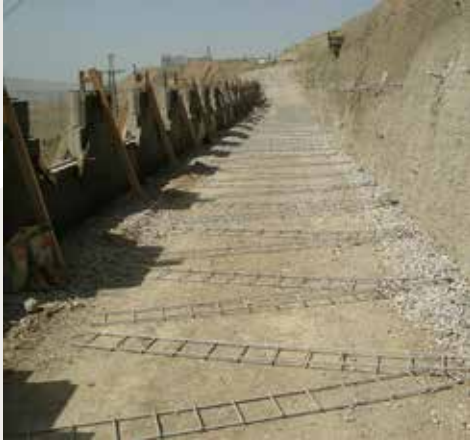
Friction Link system with steel strips

The TerraLink™ technique allows the construction of Reinforced Earth® walls in front of existing structures, with narrow space between them. Since the reinforced fill zone is not wide enough to accommodate conventional lengths of reinforcements, the acceptable solution consists in connecting the Reinforced Earth mass to the existing structure. The whole configuration forms a shored retaining wall that ensures a sound structural behavior.