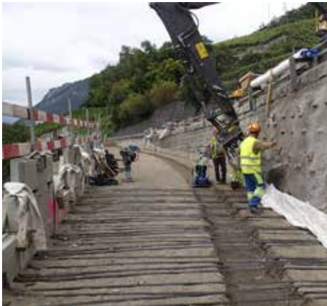
Friction Link system with synthetic strips

TerraLink™ elements are similar to those used for Reinforced Earth® solution: soil reinforcements (steel or geosynthetic), connected to modular facing systems (precast concrete panels, welded wire mesh and connection parts). These elements are placed between well compacted backfill layers. The main feature is that reinforcements are linked to the rear part (backface) of the system through the existing structure, which enables combination or continuity of the reinforcements between the narrow Reinforced Earth® wall and the existing structure.