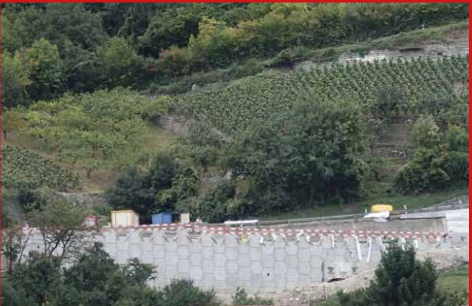
RC 62 near Sion, Switzerland