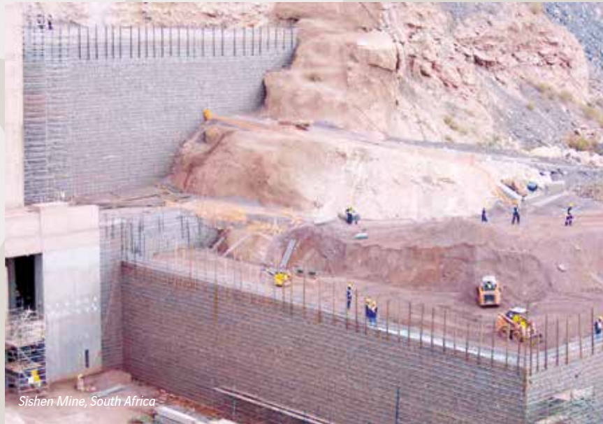
Sishen Mine, South Africa

Our goal is to create, design and supply innovative techniques to the civil engineering industry with a strong commitment to excellence in design, service and public welfare.