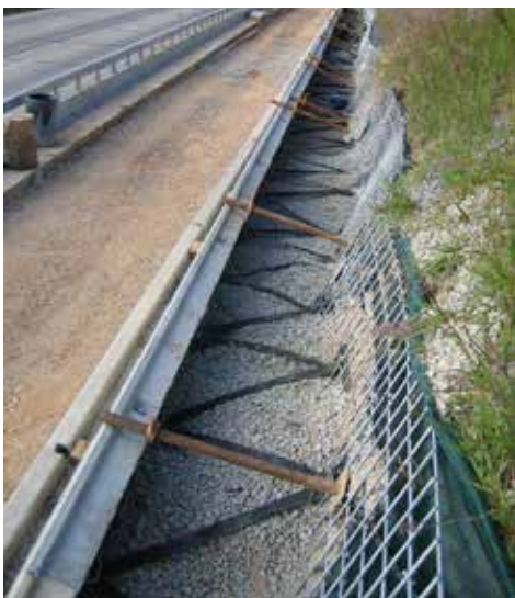
Direct Link system with synthetic strips

The reinforcements of the Reinforced Earth® wall are directly connected to the existing structure. This solution easily adapts to very narrow or limited space but requires further precautions in terms of construction.