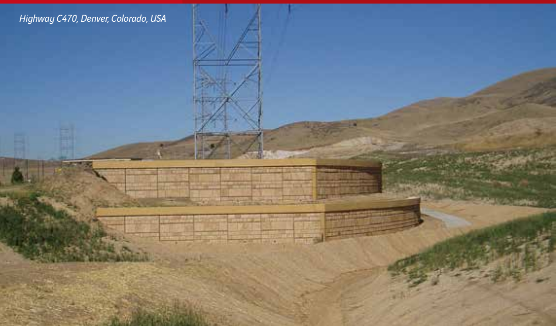
Highway C470, Denver, Colorado, USA