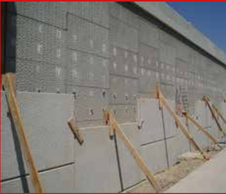
I-215 On-Ramp to Southbound I-15 Ramp widening, Salt Lake County, Utah, USA