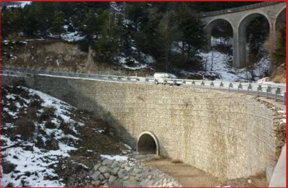
RN 116, Créneaux du Pallat, France