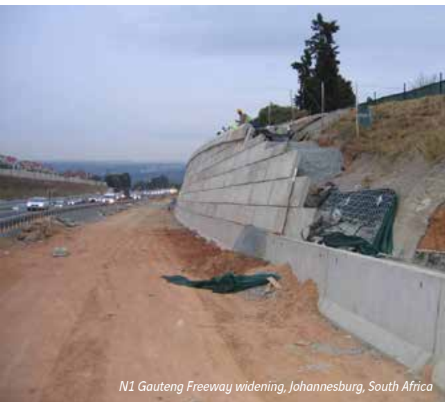
N1 Gauteng Freeway widening, Johannesburg, South Africa