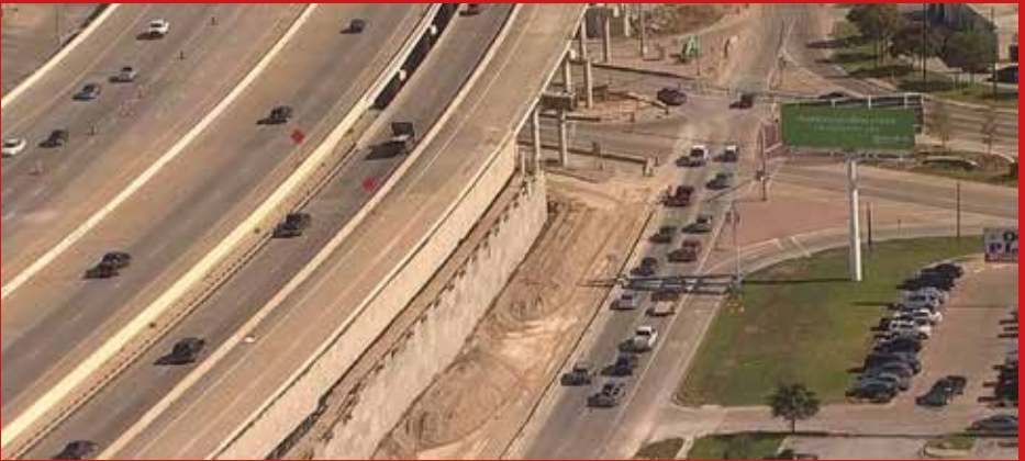
North Tarrant Express near Dallas, Texas, USA