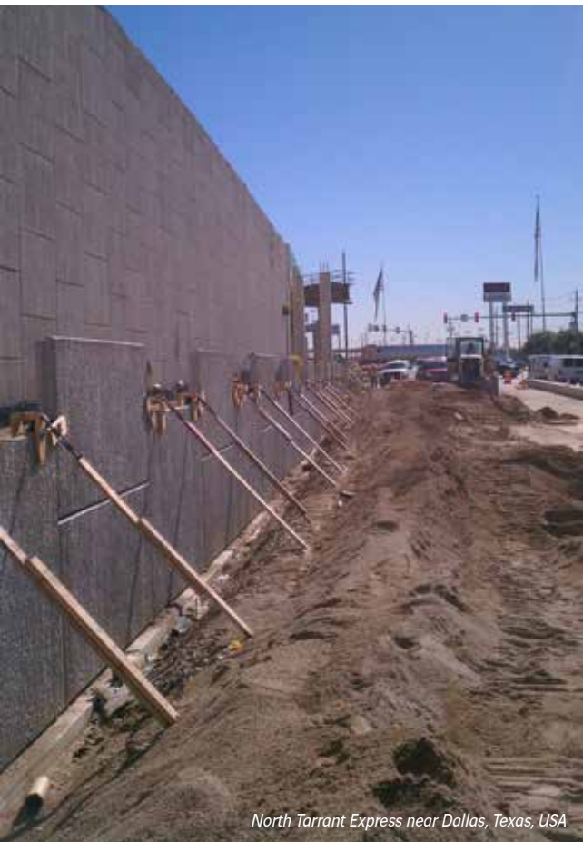
North Tarrant Express near Dallas, Texas, USA