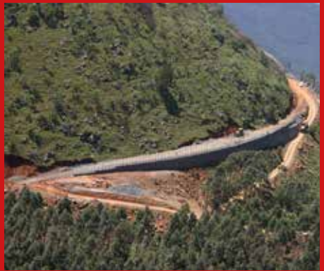
Langeni, South Africa