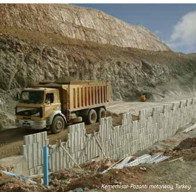
Kemerhisar-Pozanti motorway, Turkey