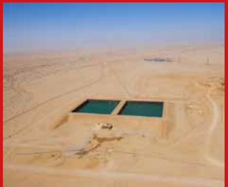
Trekkopje reservoirs, Namibia