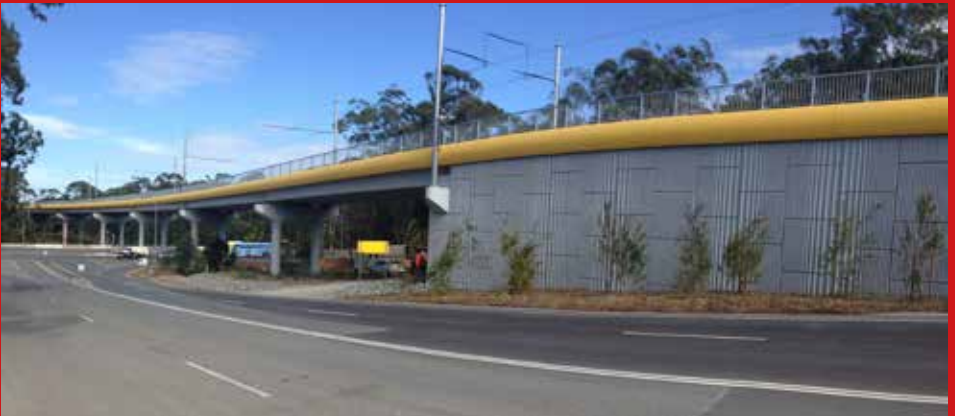
Gold Coast Rapid Transit Project, Australia