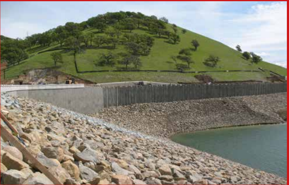
Los Vaqueros dam, California, USA