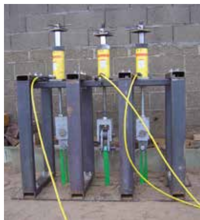
Strength testing the panels under the effect of the tensile load of reinforcements