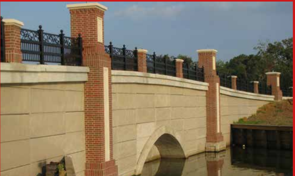
Beacon Island, Texas, USA