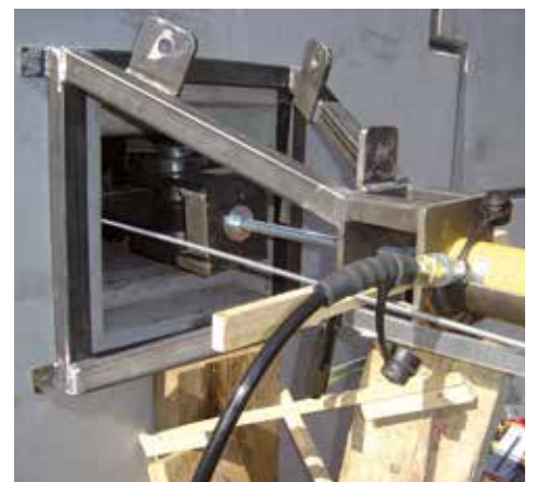
In situ extraction tests