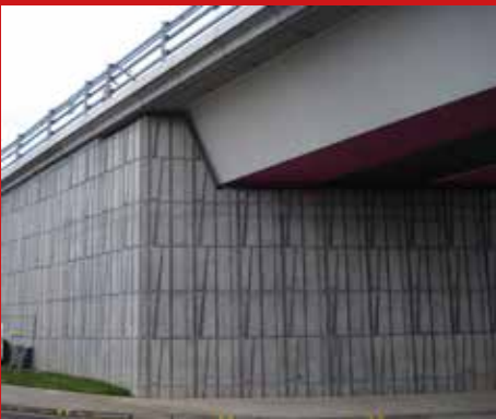
Access ramp to the London 2012 Olympic games site, United Kingdom